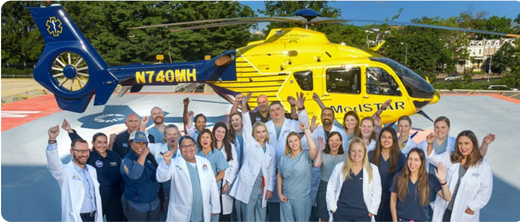
Members of The Burn Center team on the hospital's helipad.

In July , The Burn Center at MedStar Washington Hospital Center celebrated its 50th anniversary and a half-century of providing groundbreaking surgical, critical, and rehabilitative care that has benefited the health and well-being of individuals across the Washington Metropolitan region, including firefighters, members of law enforcement, and 10 people injured during the terrorist attacks on the Pentagon on Sept. 11, 2001.