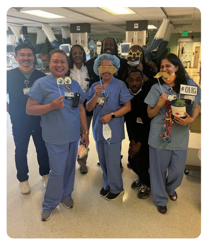
14 • MedStar Harbor Hospital • Nursing Annual Report • FY23