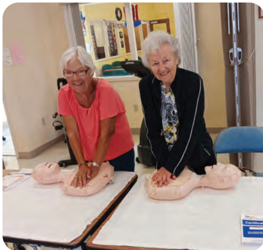
▲ MedStar Franklin Square's Community Health team offered Hands-Only CPR training at Rosedale Senior Center in June.

MedStar Health offers the following training programs throughout the region to ensure members of the communities we serve are prepared to respond in the event of an emergency.