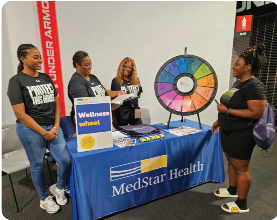
▲ MedStar Health partnered with Under Armour to provide nearly 700 free sports physicals for students. There were sports bra fittings, and back-to-school resources for student athletes, as well. Our Community Health team provided free blood pressure screenings, a wellness wheel, education about healthy foods and beverages, Hands-Only CPR, 988 information, and more. The event was made possible through Project Rampart, an ongoing six-year partnership designed to elevate the high school student athlete experience and improve academic performance through the power of sports.

Below are some of our recent outreach events.