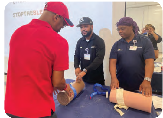
▲ MedStar Health's hospital responders conduct a Stop the Bleed training at a community health and wellness center.

Traumatic injuries that cause uncontrolled bleeding are a leading cause of preventable death for people of all ages throughout the country.