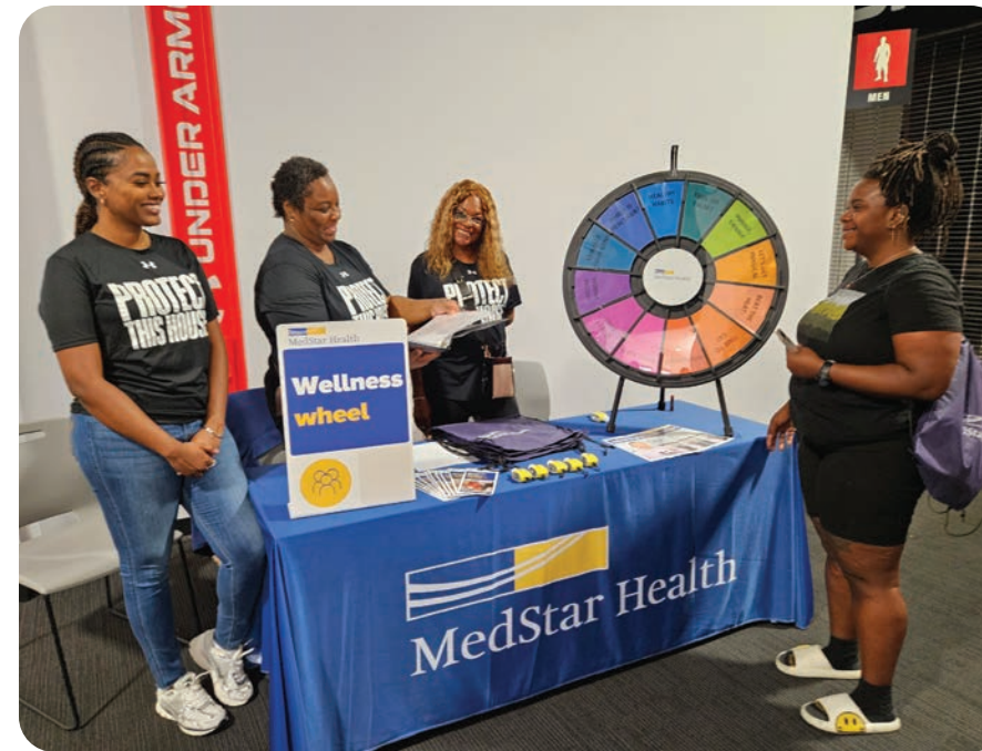
▲ MedStar Health partnered with Under Armour to provide nearly 700 free sports physicals for students. There were sports bra fittings, and back-to-school resources for student athletes, as well. Our Community Health team provided free blood pressure screenings, a wellness wheel, education about healthy foods and beverages, Hands-Only CPR, 988 information, and more. The event was made possible through Project Rampart, an ongoing six-year partnership designed to elevate the high school student athlete experience and improve academic performance through the power of sports.

Below are some of our recent outreach events.