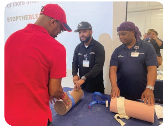
▲ MedStar Health’s hospital responders conduct a Stop the Bleed training at the Middle Branch Fitness & Wellness Center.

Traumatic injuries that cause uncontrolled bleeding are a leading cause of preventable death for people of all ages throughout the country.