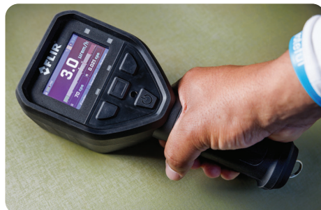
An identiFINDER R-series is a handheld radiation detector.

right combination. For example, we support the breast center where patients may come for a mammogram every year. We strive to keep the dosage for mammography imaging low because of the frequency."